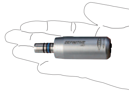
Smaller in size than many other micromotors, DEFINITIVE ® is extremely light-weight and perfectly balanced.

Micromotor is also equipped with a non-return O-ring for spray water.