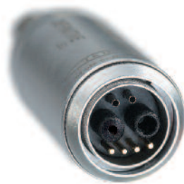
Connection of the motor to the supply silicone hose has been further simplified thanks to the use of a electrified 4-hole connection.