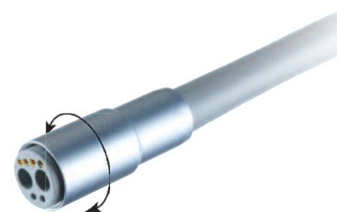
540°-swivelling connection through the special silicone hose